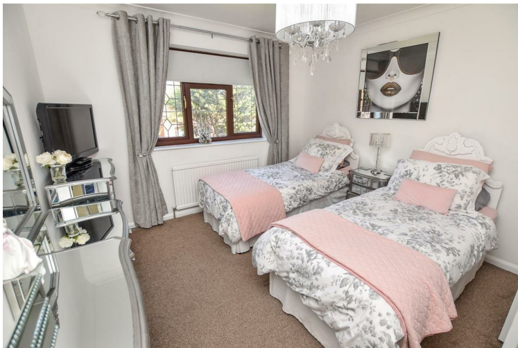
Bedroom Three 11'1 x 10'1 (3.38m x 3.07m)

Upvc double glazed window to rear aspect, coved ceiling, carpet, radiator, TV and power points.