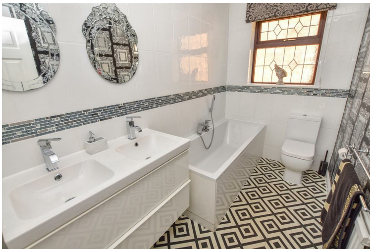
Family Bathroom 9'2 x 5'1 (2.79m x 1.55m)

Upvc double glazed obscure window to side aspect, coved ceiling, fully tiled walls, modern white suite comprising of a paneled bath, wall mounted vanity unit with inset twin wash hand basins with mixer taps, close coupled w.c, radiator.