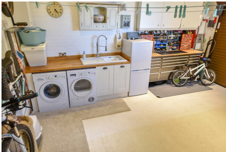
Integral Garage 17'9 x 12'8 (5.41m x 3.86m)

One and half garage with electric roller door to front, lighting and power points. Fitted units with inset sink, space for washing machine, tumble dryer and freestanding fridge freezer. Integral door to main house.