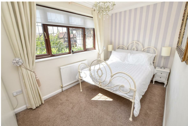
Bedroom Four 12'3 x 9'5 (3.73m x 2.87m)

Upvc double glazed window to front aspect, coved ceiling, carpet, radiator, TV and power points. (Access to loft which is boarded)